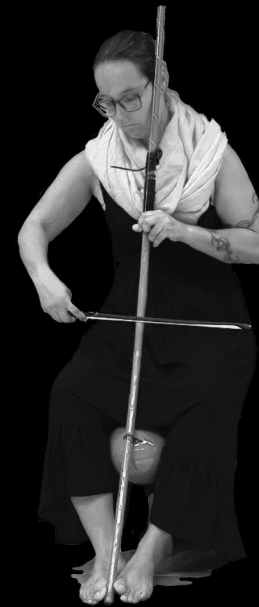
Vom Erlkönig | Solo Performance in Zurich